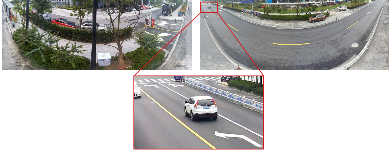
360° Overview + 50x PTZ

Combining several built-in horizontal cameras with PTZ power, one PanoVu camera captures 360° or 180° panoramic images as well as close-up images with up to 50x optical zoom. These cameras provide high-resolution images with more detail. Note, too, that the panoramic images are stitched together within the camera itself, so users will not need another server or add-on to enjoy full use of the cameras.