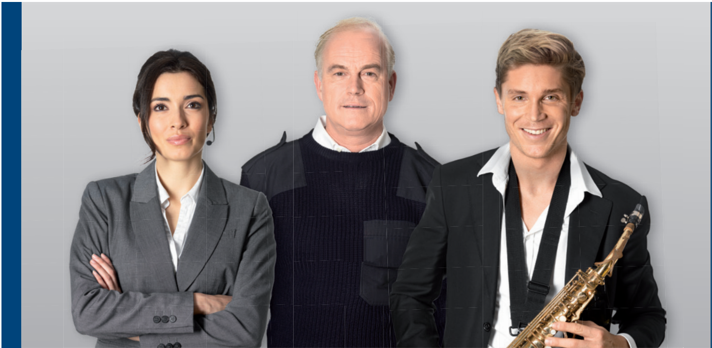
PAVIRO: Public Address, Voice Evacuation, Professional Sound Quality