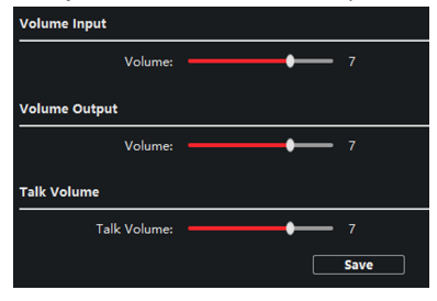
Figure 3-14 Volume Input and Output

1. Click Volume Input/Output to enter the volume input and output page.