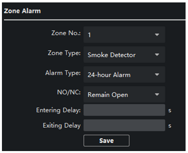
Figure 3-11 Zone Alarm

1. Click Zone Alarm to enter the zone settings page.