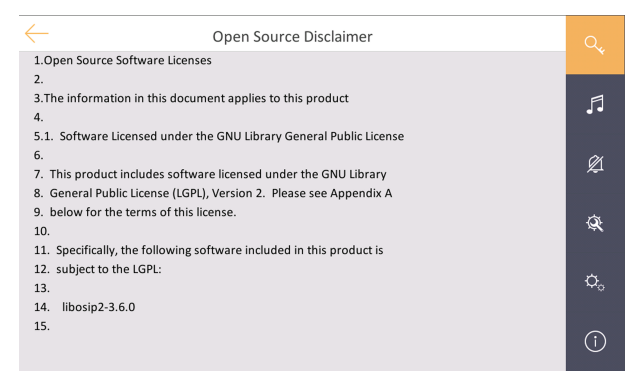
Figure 2-16 OSS Page

On the home page, tap Settings \rightarrow o to enter the open source disclaimer page.