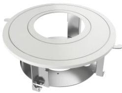
DS-DS-1227ZJ-DM42 In-Ceiling Mount