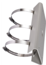
DS-1275ZI-SUS Vertical Pole Mount