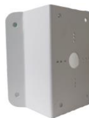
DS-1276ZI-SUS Corner Mount