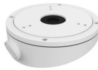
DS-1281ZJ-M Inclined Ceiling Mount